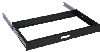
Roll out file frame