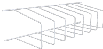
Shelf filing racks