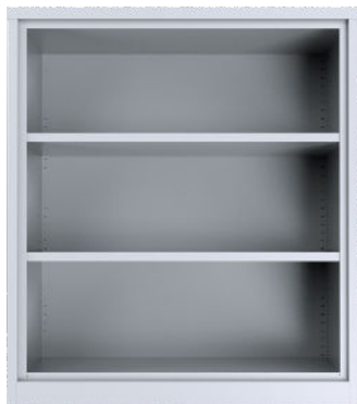
2 shelf unit