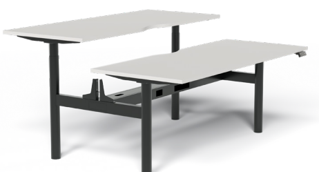
With Cable Tray and Screen Brackets