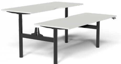
Without Cable Tray