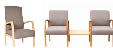
HIGH BACK custom upholstery