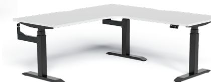
With Arms and Screen Brackets w/o Cable Tray