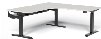
With Cable Tray and Screen Brackets