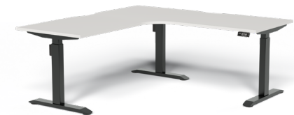
Without Cable Tray