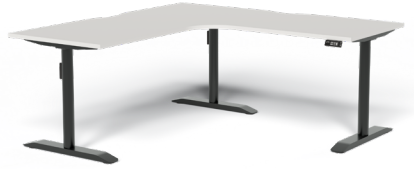
Without Cable Tray