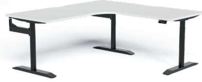
With Arms and Screen Brackets w/o Cable Tray