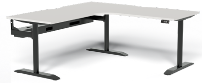
With Cable Tray and Screen Brackets